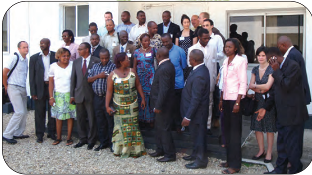
FSC Certification Workshop in Cameroon in 2009