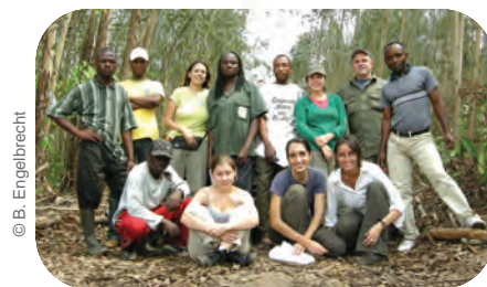
Members of the field campaign in Pointe-Noire.