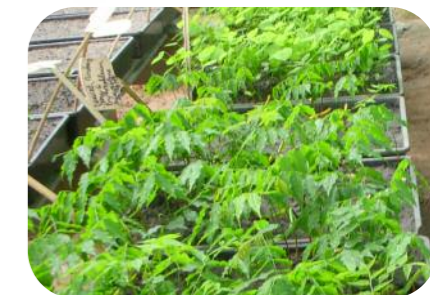
Erythroleum suaveolens seedlings.

Collected seeds were sent to the Pointe-Noire experimental station located in Congo. A seedling nursery was recently renewed by the Research Centre on Sustainable Production of Industrial Plantations (CRDPI) with the financial support of CoForChange. The seedling nursery can carry up to 58,000 plants. Shading and watering treatments will be applied to test species response to light and water availability.