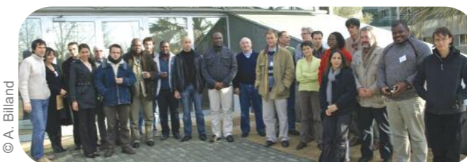
Montpellier, 3 to 6 February 2009. CoForChange kick-off meeting.

The CoForChange kick-off meeting was held in Montpellier, from 3 to 6 February 2009. It was dedicated to sharing information, discussing scientific topics, outlining the road map for scientific and administrative activities, securing the budget, and making decisions on the communication plan. Thirty colleagues, from most of the 14 partner institutions, attended this first meeting. Three working groups met to discuss and coordinate the following: collection of environmental information, planning of paleoenvironmental studies, and seed collection and transport to Congo for the production of seedlings. Besides promoting discussions between colleagues, the meeting helped strengthen the scientific logic of the project. The next meeting is planned for the end of November.