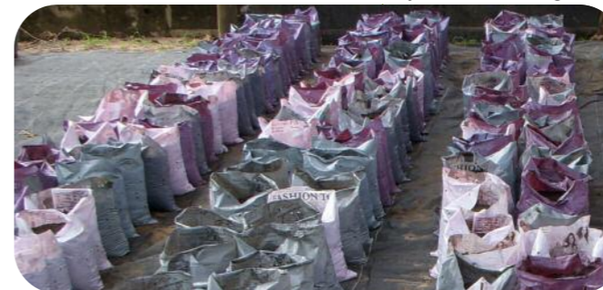
Pots ready to receive seedlings.